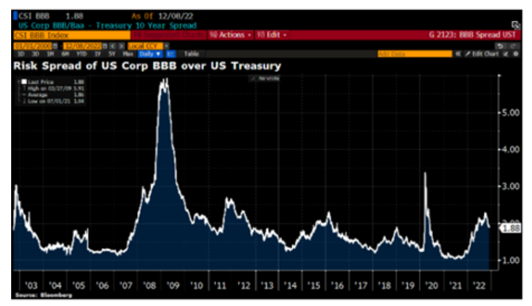
Chart 1: US Corporate BBB/Baa – Treasury 10 Year Spread